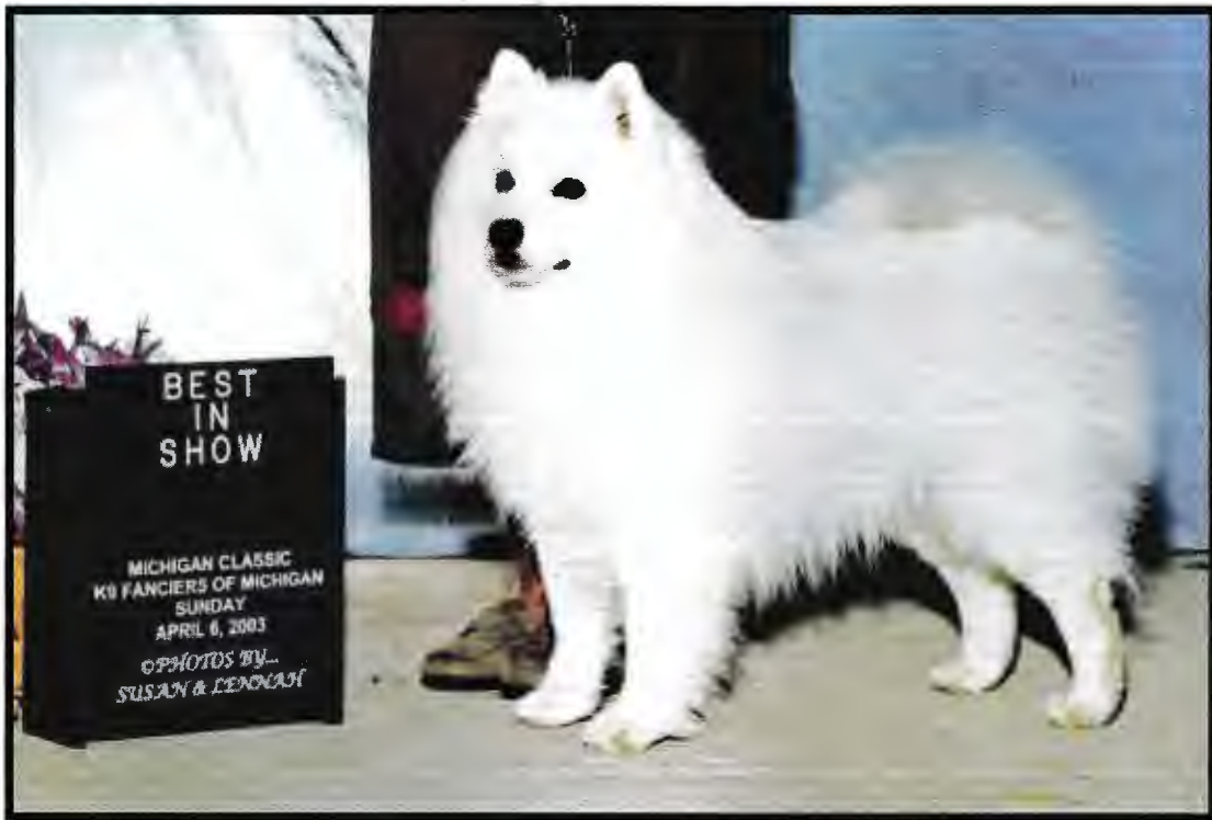
UKC #1 GR CH 'PR' Pinebrook Rushmore Reagan "Rush"